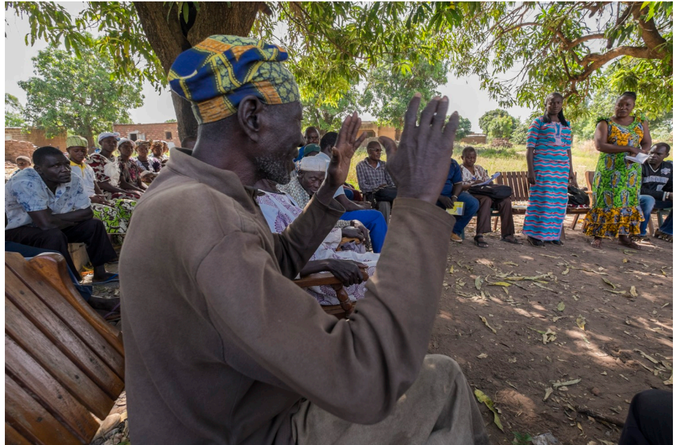
Fig 1. Listening and talking in Burkina Faso.

https://doi.org/10.1371/journal.pntd.0007233.g001